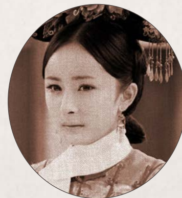
Ya-Nan {The Concubine}

She continuously plots against Chao Chen, trying to end her “worthless” music career, while attempting to marry her off to a Chinese.